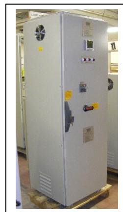
150KVA Varmatic Vario