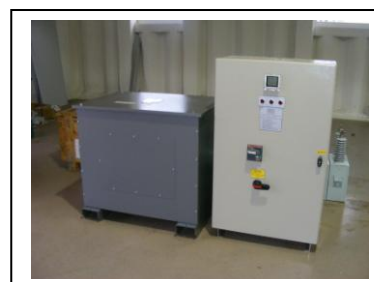
200KVA Varmatic Vario